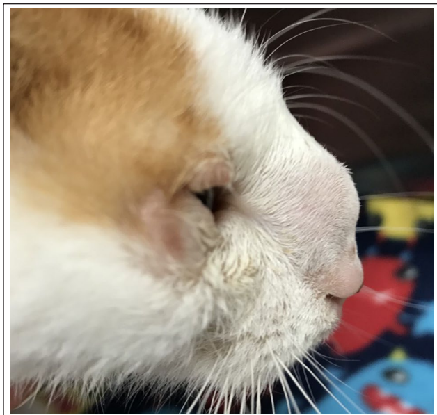
Figure 1 Facial deformity caused by fungal rhinitis in a cat with histoplasmosis