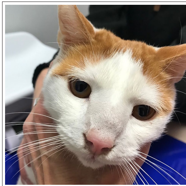
Figure 4 Improved facial deformity and resolved periocular disease in a cat 3 months after treatment for histoplasmosis

the nasal cavity was flushed with 1 ml of 0.9% NaCl, with most of that volume being recovered. Nasal flush infusate was submitted for cytopathology, which revealed pyogranulomatous inflammation with intracellular yeast organisms most consistent with H capsulatum (Figure 3). In addition, H capsulatum was grown in fungal culture of nasal infusate. Fluconazole was discontinued and itraconazole (5mg/kg PO q12h until disease resolution [Itrafungol; Elanco]) was prescribed. Voriconazole 1% ophthalmic drops (compounded, 1 drop OU q12h for 5 weeks) was prescribed; 0.75 mg dexamethasone (final concentration of 0.05mg/ml) was subsequently added to the drops for anti-inflammatory effects. Robenacoxib (1.4mg/kg q24h for 3 days, then every other day × three doses [Onsior; Elanco]) was also prescribed.