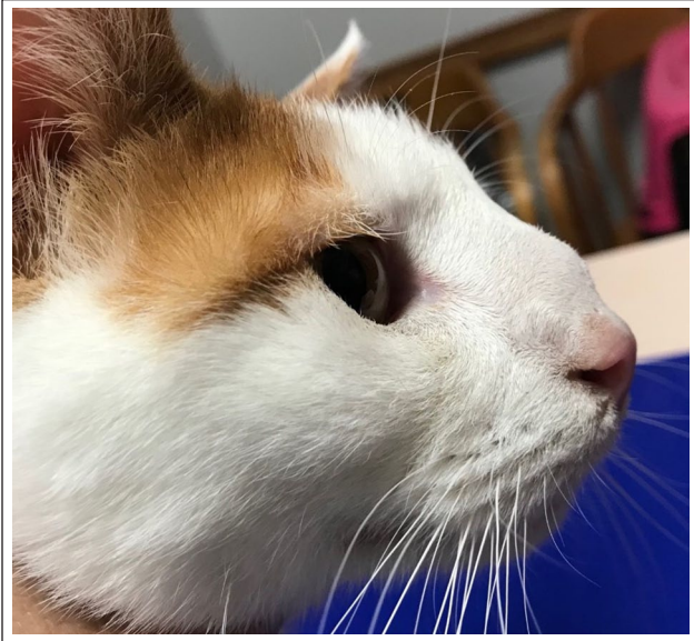
Figure 5 Improved facial deformity and resolved periocular disease in a cat 3 months after treatment for histoplasmosis