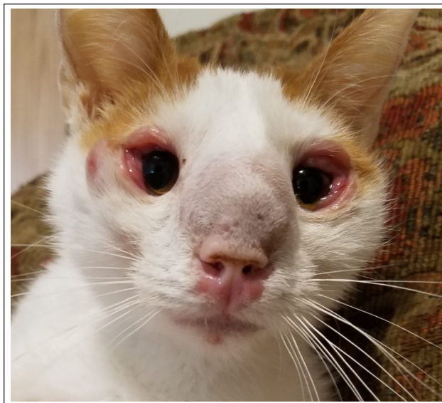
Figure 2 Facial deformity and periocular involvement in a cat with histoplasmosis

Two weeks after the initial hospital visit, the cat was again presented for continued sneezing, and ocular and nasal discharge. Physical examination was unremarkable and booster vaccinations were administered. Three months after the initial hospital visit, the cat was re-examined for persistent ocular and nasal discharge. Examination revealed a mild fever (103.1°F [39.5°C]), bilateral chemosis and a (0.5 cm diameter) cutaneous nodule near the lateral canthus of the right eye. In-house fine-needle aspiration (FNA) cytopathology of the cutaneous nodule showed suppurative inflammation. Neither bacterial nor fungal organisms were seen. Cytopathology was not submitted for clinical pathologist review. The sample was not submitted to microbial culture. Based on the clinical findings, a presumptive diagnosis of viral upper respiratory infection was made and