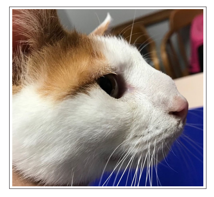
Figure 5 Improved facial deformity and resolved periocular disease in a cat 3 months after treatment for histoplasmosis