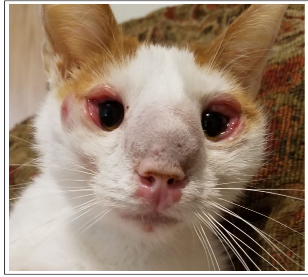
Figure 2 Facial deformity and periocular involvement in a cat with histoplasmosis