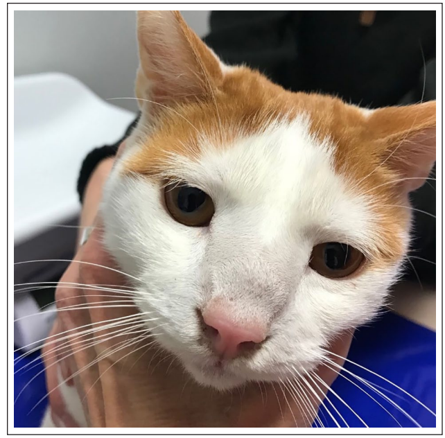
Figure 4 Improved facial deformity and resolved periocular disease in a cat 3 months after treatment for histoplasmosis

Over the following month (3.5-4.5 months after the initial hospital visit) the ocular and nasal discharge, periocular signs, activity level and appetite improved. The swelling over the nose persisted and terbinafine (compounded, 30 mg/kg PO q12h administered for 11 days) was added to the treatment regimen. Within 2 weeks (5 months after the initial hospital visit) the cat developed anorexia, vomiting and diarrhea. Serum biochemistry showed increased alanine transaminase (ALT; 243U/l; reference interval [RI] 12–130U/l) and alkaline phosphatase (ALP) activity (135 U/l; RI 14-111 U/l). The remainder of the biochemistry analysis and complete blood count were within the RIs. Owing to suspicion of adverse effects related to terbinafine, terbinafine was discontinued and metronidazole (compounded, 16mg/kg PO q12h for 21 days), capromelin (3mg/kg PO q24h unknown duration [Entyce; Aratana Therapeutics]) and an injection of maropitant (1 mg/kg SC)once [Cerenia; Zoetis]) were prescribed. Itraconazole was continued as previously prescribed. Soon after, the cat's