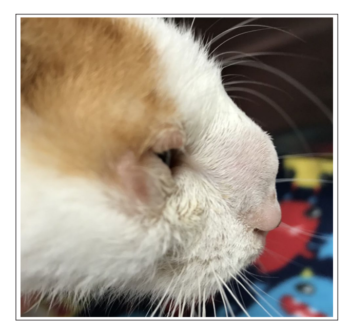
Figure 1 Facial deformity caused by fungal rhinitis in a cat with histoplasmosis